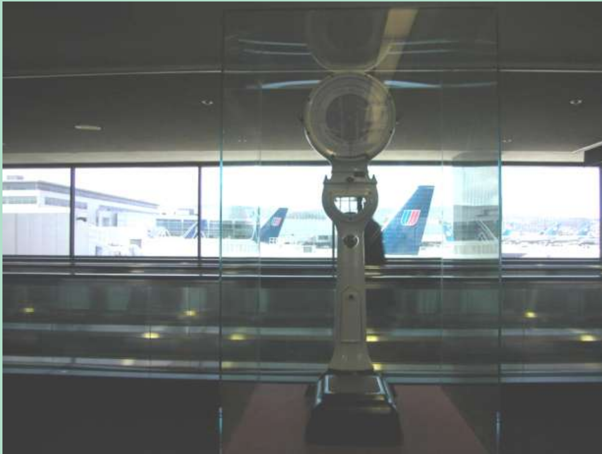
San Francisco International Airport Museum