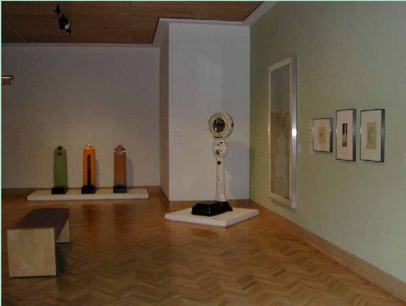
Riffe Gallery, Columbus, Ohio