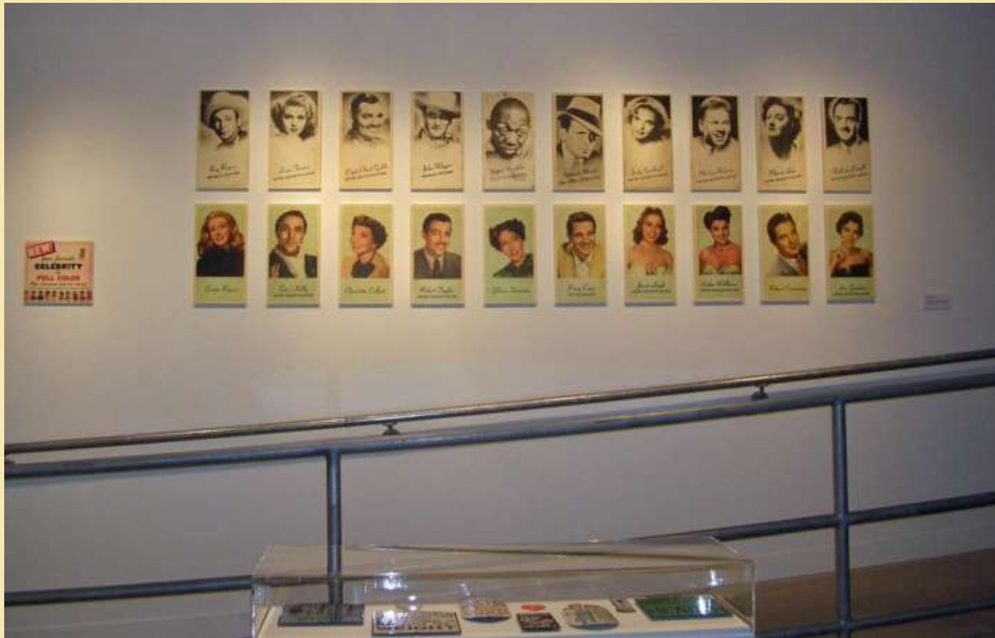
Enlarged Tickets for Peerless Ticket Scales