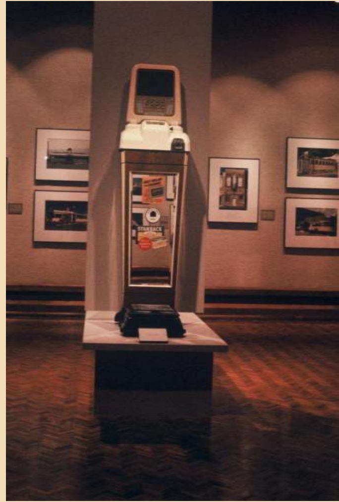
Photography of John Margolies