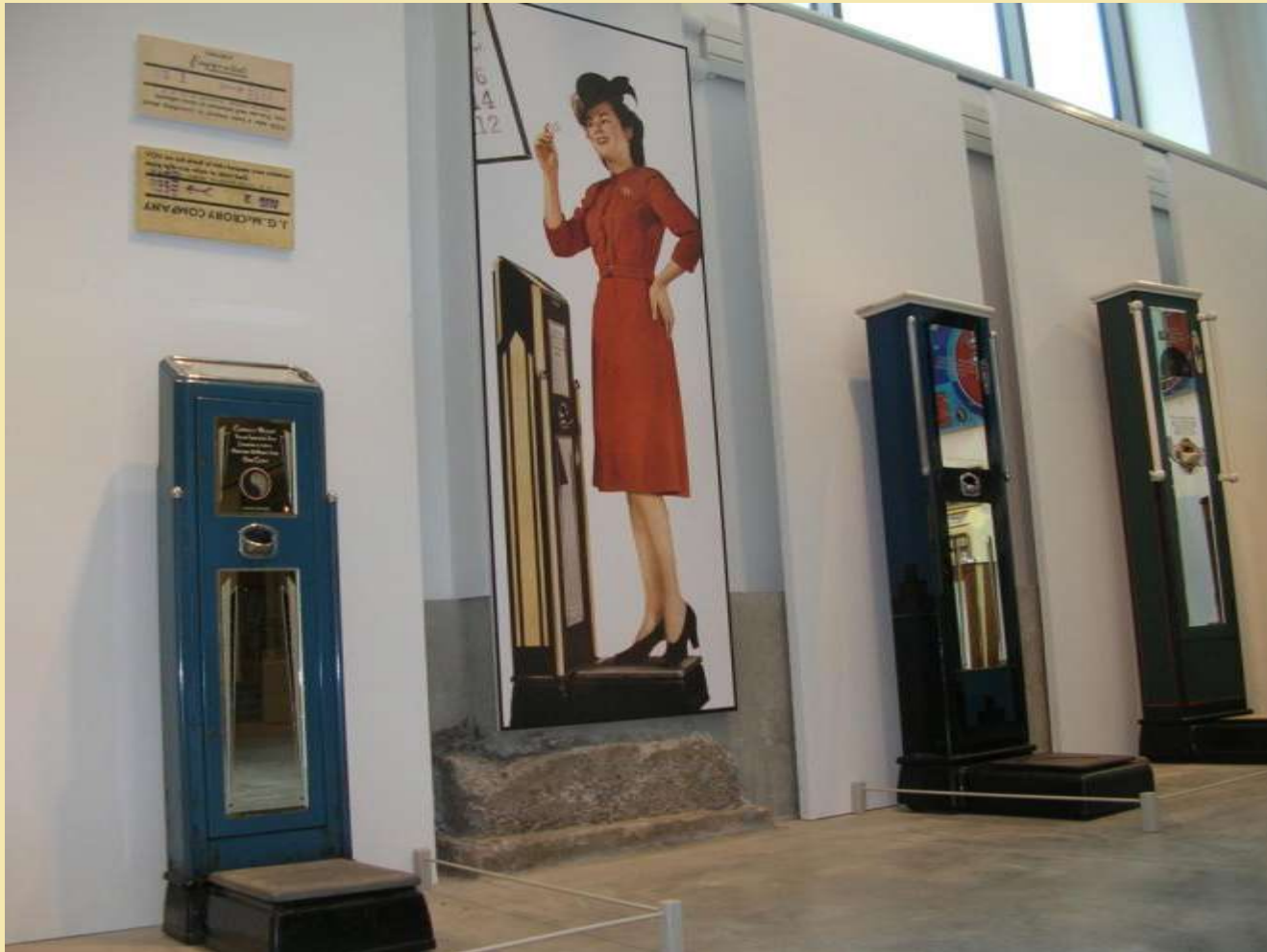
Peerless Hollywood Ticket Dispensing Scales