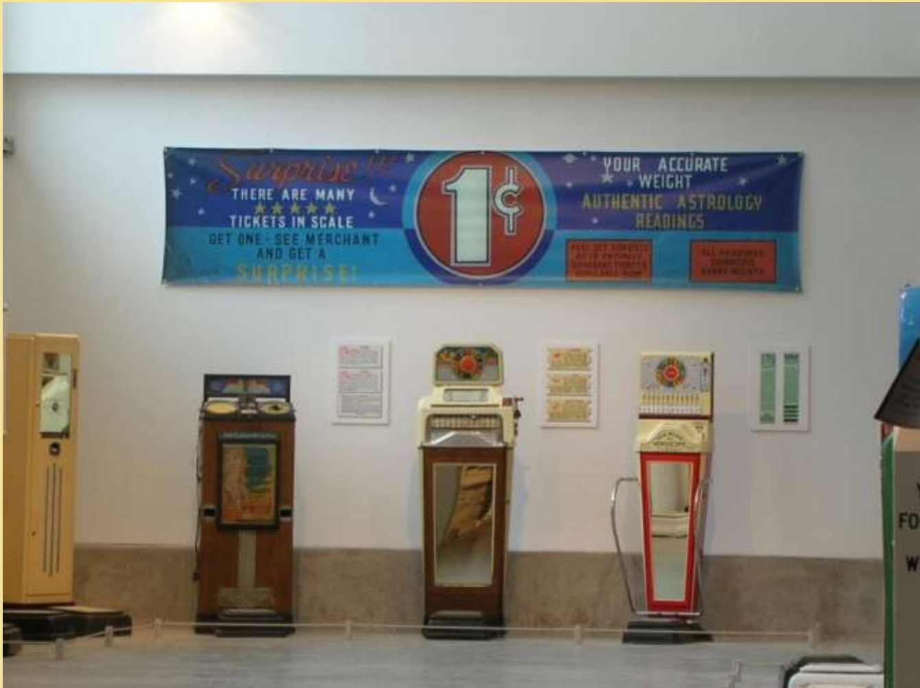
Horoscope Dispensing Scales