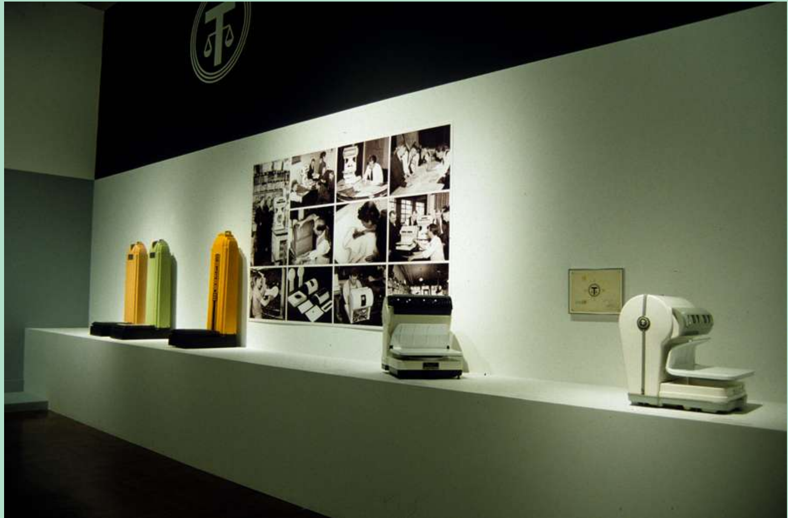
Toledo Art Museum, Toledo, Ohio